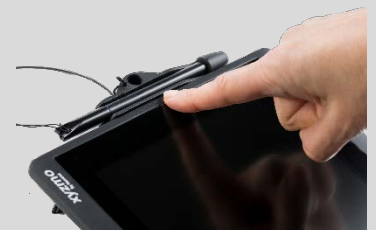
Flexible mounting of pen station