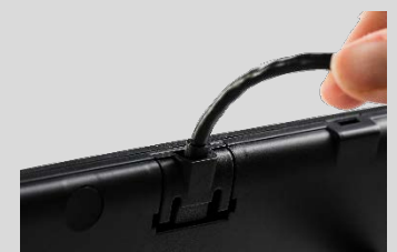
USB cable protection clasp