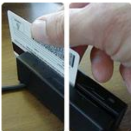
Swipe or Scan

Nothing is easier than completing a form automatically simply by scanning/swiping your credit card or driver's license to obtain important information. Any additional required data can be captured via a soft keyboard. Signing and sealing documents are performed electronically, and can be automatically sent to the customer using the provided email address. Verification of the authenticity/integrity of documents and storage problems will no longer be an issue for your company and customers.