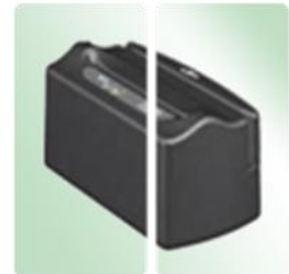
All-in-one magnetic card reader/ barcode scanner