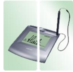
Low-cost signature pad