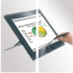
17" touch-screen/ digital pen display