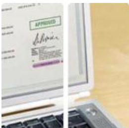
Convert & Seal

Attach Scanned Passport, Drivers License or any other Document