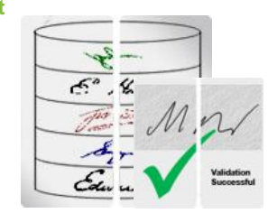
Verify Signature Comparing a Handwritten Signature Against a Pre-Enrolled Profile