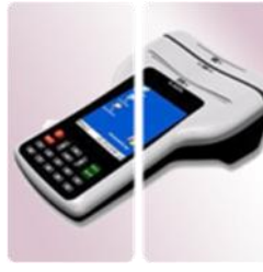
All-in-one portable wireless device