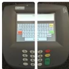
Data Capture Using a Soft Keyboard