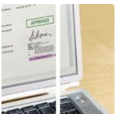
Convert & Seal Convert any Document to PDF and Seal it