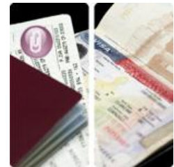
Attach Document Attach Scanned Passport, Drivers License or any other Document