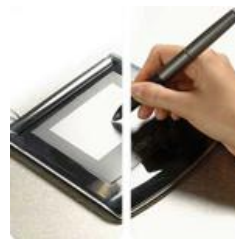
Signature Capture Using a Signature Pad, Tablet PC, etc