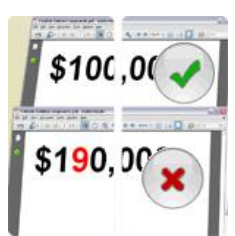
Verify Documents Verify Signed & Sealed Documents with a Single Click