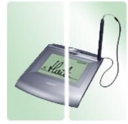
Low-cost signature pad