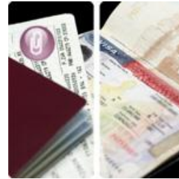
Attach Document Attach Scanned Passport, Drivers License or any other Document