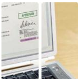
Convert & Seal Convert any Document to PDF and Seal it