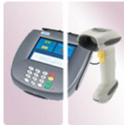
Fixed stand magnetic card reader, signature capture device and portable barcode scanner