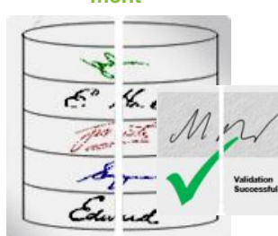
Verify Signature Comparing a Handwritten Signature Against a Pre- Enrolled Profile