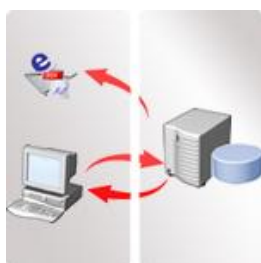
Email & Store Send Documents Via E-Mail, Store and Retrieve Documents