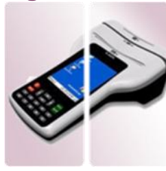
All-in-one portable wireless device