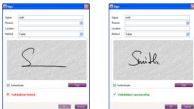
A Biometric Signature Profile