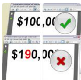
Verify Documents Verify Signed & Sealed Documents with a Single Click