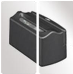
All-in-one magnetic card reader/ barcode scanner