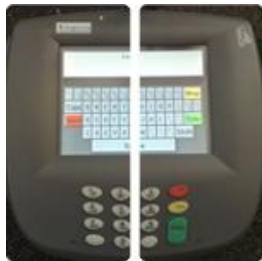
Data Capture Using a Soft Keyboard