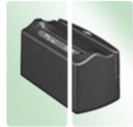
All-in-one magnetic card reader/ barcode scanner