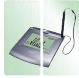
Low-cost signature pad