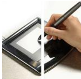
Signature Capture Using a Signature Pad, Tablet PC, etc